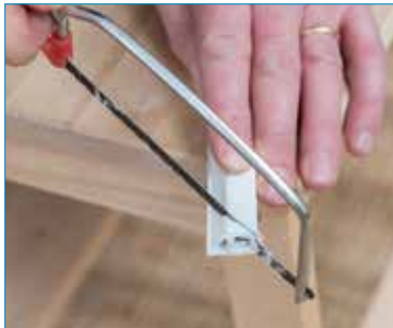
Mitre the corners