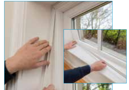
Apply back glazing strips to window frame. For larger windows, it is recommended that glazing strips are also screw fixed.