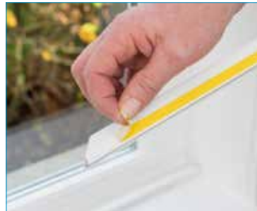
Peel back adhesive strip from back glazing strip