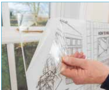
Remove masking films