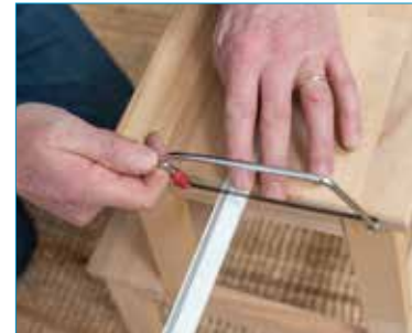
Cut glazing strips to size using a small hacksaw