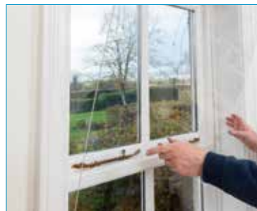
Place sheet in glazing strips