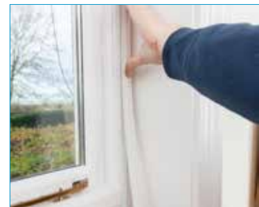
Cover with snap-on front glazing strips